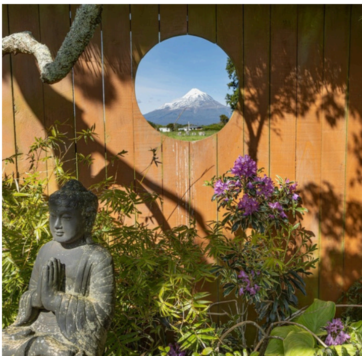
Dondo (#14) in rural Inglewood