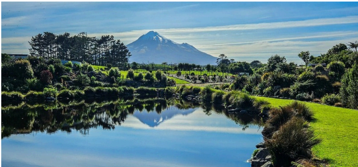
Lakeside Garden (#41)

The 20th Taranaki Fringe Garden Festival (TFGF) recently concluded, running from 1-10 November, 2024, and once again showcasing why Taranaki is a must-visit destination for garden enthusiasts. Every year, this festival draws visitors from across New Zealand and beyond, shining a spotlight on the beauty, creativity, and passion that define our region's gardens.