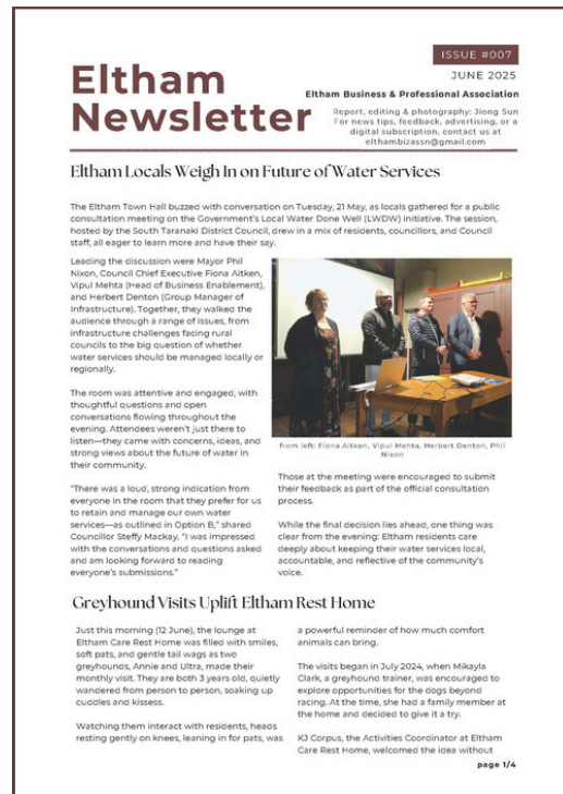
A recent issue of the Newsletter

Designed to support and engage our vibrant town, the newsletter reaches a wide audience through print, email, and social media. It's an essential local resource for staying informed and involved in Eltham.